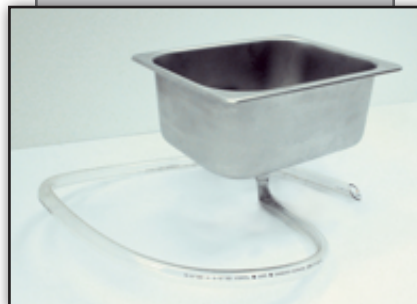
Model #4137 Urology Pan