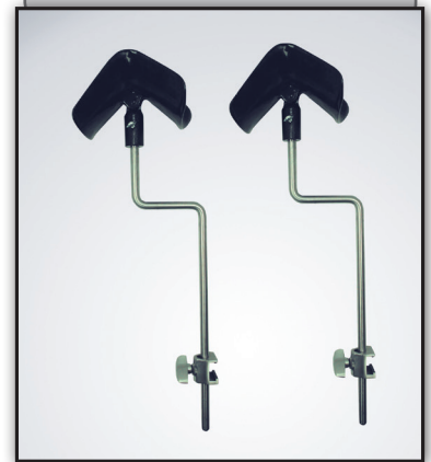
Model #4122 Knee Crutches

Requires #4111 Headend Rails and #6109 or #6110 clamp