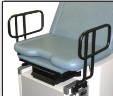
Model #4128 Grab Rail System