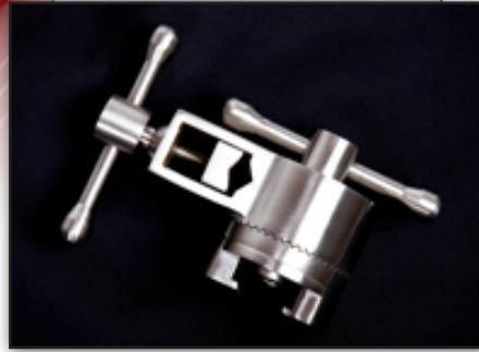
Model #6110 Tri-Clamp