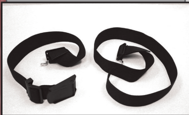
Model #4126 Restraint Straps (pair)