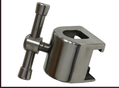
Model #6109 Universal Clamp