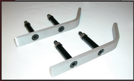
Model #4112 Footend Rails