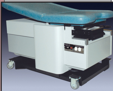
Model #4150 Caster Base